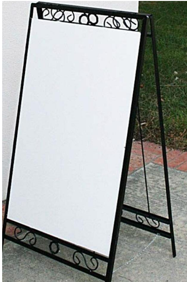
EXHIBIT D: SANDWICH BOARD SIGNS